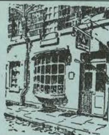
Telephone BATH 4328