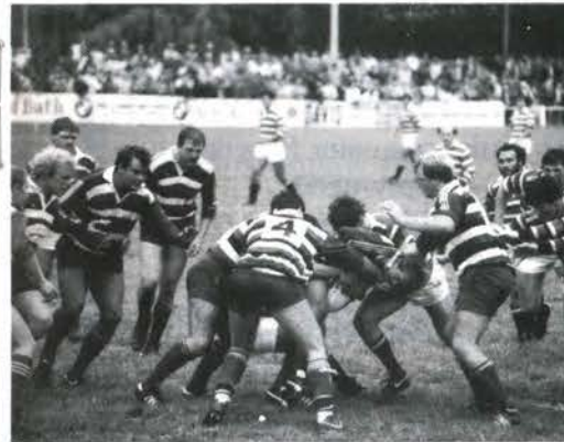
BATH v. LEICESTER