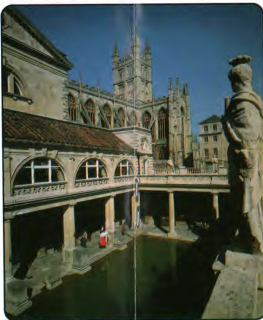
LUCOZADE IS THE OFFICIAL DRINK OF BATH F.C.

I - INTERNATIONAL L - BRITISH LIONS A - A INTERNATIONAL