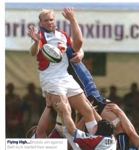
Flying High...Bristols win against Bath kick started their season

One thing is for certain, however. It's Bristol vs Bath and, whatever the competition and whoever is playing, both teams will be giving it 100%. May the best side win.