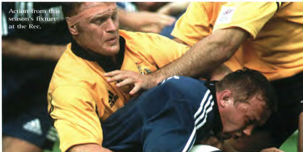
Action from this season's fixture at the Rec.