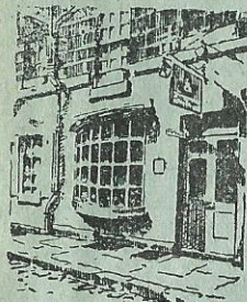
Telephone BATH 4328