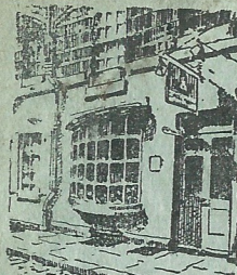
Telephone BATH 4328