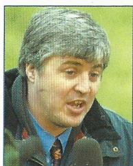
COMMENTATOR Stuart Barnes